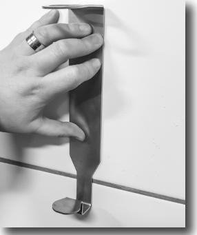
6. Fit the fixation plate against the wall. Make sure to press it hard and level the plate.