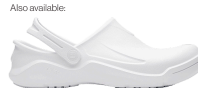
Zinc II White: 42459

Slip resistance test according to EN ISO 20344:2021, conducted by Interlink Testing Services Shenzhen Ltd, in August 2022, on a scale of 0.0 (without slip resistance) to 1.0 (very high level of slip resistance, e.g. on dry carpeted floors). All SFC shoes are fitted with the patented, slip-resistant Shoes For Crews outsole.