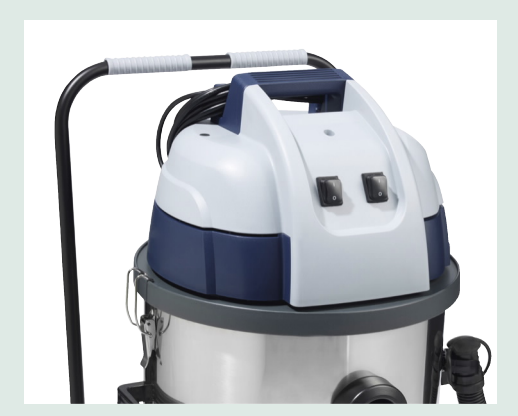
Dual or single motor