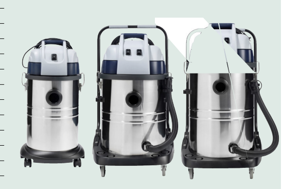
Available in 3 different sizes: 35 ltr., 55 ltr. and 75 ltr.

Speciifcations and details are subject to change without prior notice.