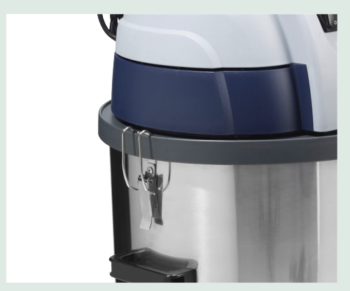
Locking mechanisms are designed for single handed use

VL100 is fully compatible with the range of accessories offered with the rest of the Nilifsk Dry canister vac portfolio, allowing easy interchangeability and reducing the overall operating costs of your complete Nilifsk cleaning solution. A good and reliable choice for contract cleaners, institutions, hospitality and retail.