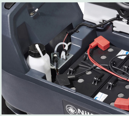
Detergent mixing system gives the user the option to clean with water only and to add detergent when really needed