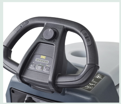
Ergonomic handle with touchpoints, One-Touch ^{\text{TM}} button and instruction stickersmakes the machine simple for the operator to get started