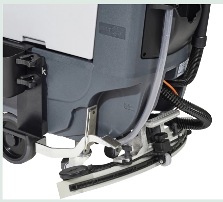
Increased suction performance with the curved squeegee system and patented blade retainer