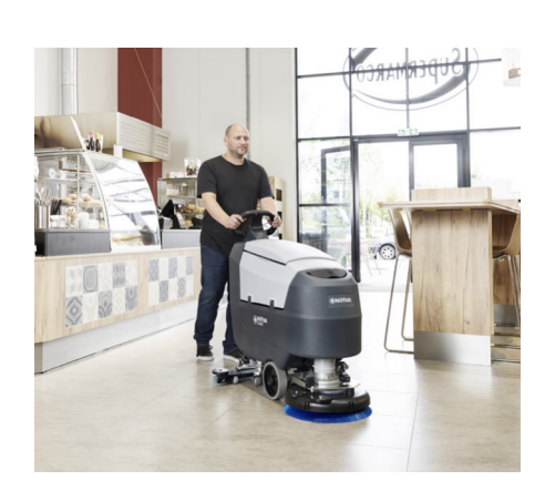
The Nilifsk SilentTech™ technology reduces the sound level from 65dB(A) - and down to 60dB(A) in silent mode